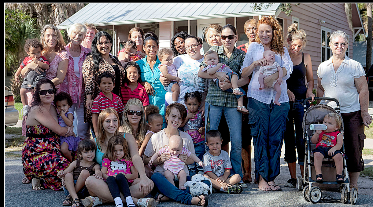
Current and recent residents in front of Genesis House I, Oct 2012

IT IS THE MISSION of Genesis House, Inc. to provide transitional shelter for homeless women and their children, long-term housing for student mothers with children, and shelter for homeless pregnant women. Genesis House, Inc. is committed to providing a safe, supportive, caring environment. Education, self-discipline, self-reliance, and independence from the welfare system are earnestly promoted. Counseling, personal improvement classes, and appropriate health care are obtained for all residents. Classes in childbirth and parenting are provided as needed.