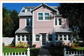
Genesis House II provides a home for homeless mothers and their children while the mothers complete their education.