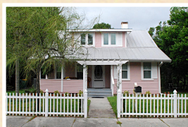
Genesis House III provides shelter for homeless women, mainly pregnant women, but occasionally shelters recently homeless single adult women who are in desperate situations.

IT IS THE MISSION of Genesis House to provide transitional shelter for homeless women and their children, long-term housing for student mothers with children, shelter for homeless pregnant women, and shelter for single recently homeless women. Genesis House, Inc. is committed to providing a safe, supportive, caring environment. Education, self-discipline, self-reliance, and independence from the welfare system are earnestly promoted. Counseling, personal improvement classes, and appropriate health care are obtained for all residents. Classes in childbirth and parenting are provided as needed.