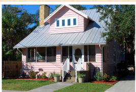
Genesis House I shelters adult mothers with children who are homeless or in transition.

• For information on attending or volunteering at any of the events, call 321-288-4754.