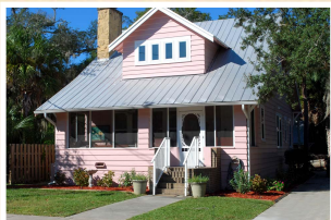
Genesis House I is an emergency shelter for adult mothers with children who are homeless.

“Genesis is the first book of the Old Testament and can be defined as a new beginning. That’s what Genesis was to me: A new beginning. I had to start over from the ground up. They gave me the tools I needed to rebuild my life. While I was there, I learned how to be accountable, I got a job, received some counseling... slowly but surely things started to get better. I left Genesis a reinvented mother and woman. I thank Genesis House for all they have done for me and my kids.”...mother of 3