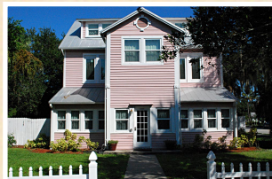
Genesis House II provides a home for homeless mothers and their children while the mothers complete their education.