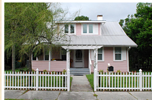
Genesis House III provides shelter for homeless pregnant women, but occasionally shelters recently homeless single adult women who are in desperate situations.

IT IS THE MISSION of Genesis House to provide emergency shelter for homeless women and their children, long-term housing for student mothers with children, shelter for homeless pregnant women, and shelter for single recently homeless women. Genesis House, Inc. is committed to providing a safe, supportive, caring environment. Education, self-discipline, self-reliance, and independence from the welfare system are earnestly promoted. Counseling, personal improvement classes, and appropriate health care are obtained for all residents. Classes in childbirth and parenting are provided as needed.